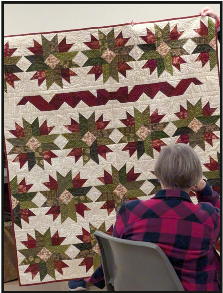
Pam's work is amazing!